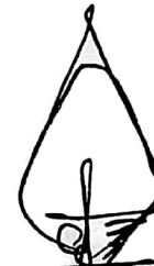
Executive Engineer, Irrigation Division, District Khyber.

Office: Jamrud Bazar near Jamrud Civil Hospital, District Khyber (Contact No. 091-5820090)